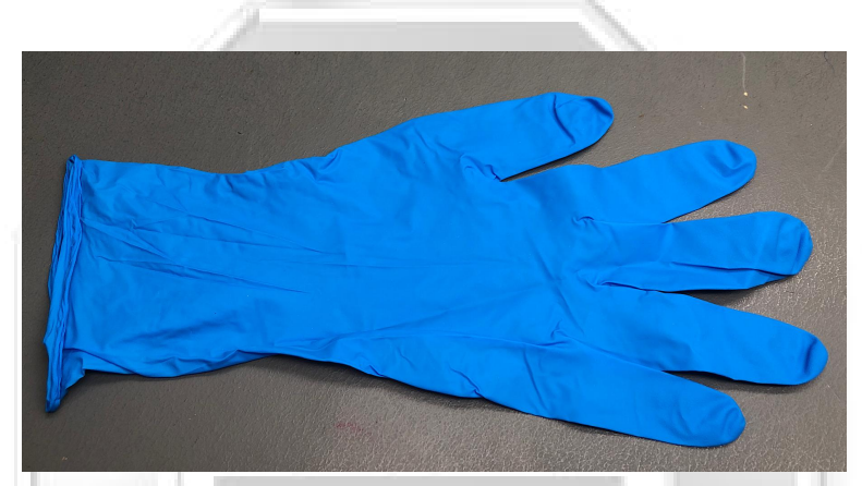
Photo 1: Nitrile Disposable Exam Gloves, Z/Z, Lot No. 20200927, Blue, Size XS