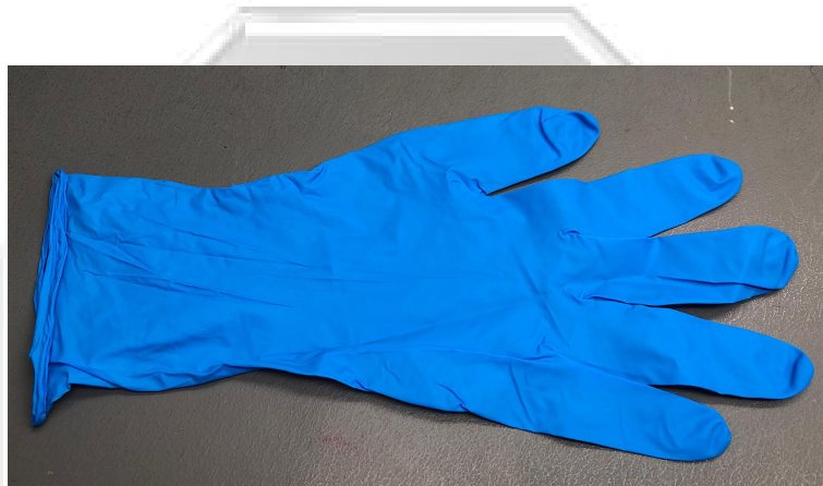
Photo 1: Nitrile Disposable Exam Gloves, Z/Z, Lot No. 20200927, Blue, Size XS